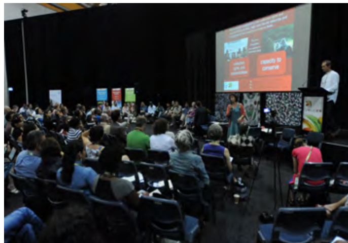
Stream 6: Enhancing Diversity and Quality of Governance

STREAM FIVE: Reconciling Development Challenges: This session focused on laying out the objectives and basic messages expected from the stream, which relate to: recognizing, accounting for and valuing the contribution of PAs to social and economic development; delivering opportunities-oriented and transformational solutions for the conservation community and the PA agenda; and encouraging the integration of PAs into national development policies. Stream leaders identified five key messages that are expected as outcomes from the stream, which aim at ensuring PAs are considered part of the economy, including on the need for: integrating PA values in economic decision-making frameworks; sufficient financing for PAs; and responsible investments and sustainable value chains.