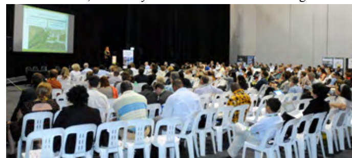
Participants during Stream Session 1: Reaching Conservation Goals

STREAM TWO: Responding to Climate Change: Focusing on the connections between climate change, biodiversity and forests, panelists discussed, inter alia : impacts of environmental change on rural livelihoods and urban water security; the role of youth in rehabilitation activities in Africa; a multi-stakeholder catchment management partnership in South America; the utility of benefits-oriented framing in