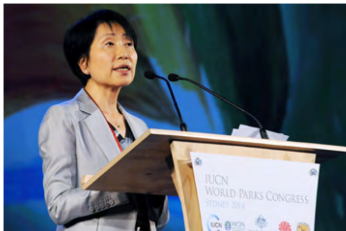
Naoko Ishii, CEO and Chairperson, GEF

the need for PA management to achieve these goals, citing the case of the Virunga National Park in Democratic Republic of Congo, where destruction of ecosystems and the massacre of gorillas have led to increased insecurity and vulnerability of communities.