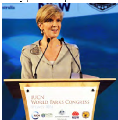
Julie Bishop, Australian Minister for Foreign Affairs

on any part of this planet has a direct correlation to our survival as a species. Highlighting the work of the North Australian Indigenous Land and Sea Management Alliance, he said the challenge is “to be courageously truthful about our predicament” and face the need to modify our ways.