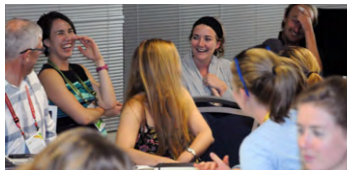
The session closed with interactive small-group discussions

The session closed with interactive small-group discussions around topics relating to action, including: personal motivation; setting a clear vision and goals; creating a motivating environment; and communicating and crafting messages.