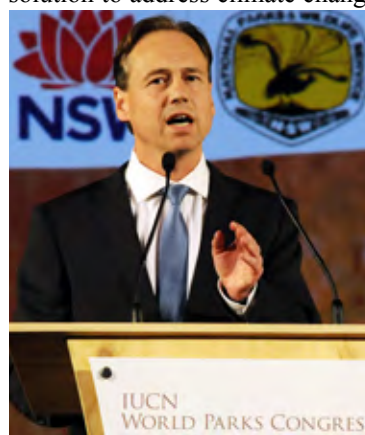
Greg Hunt, Australian Minister for the Environment