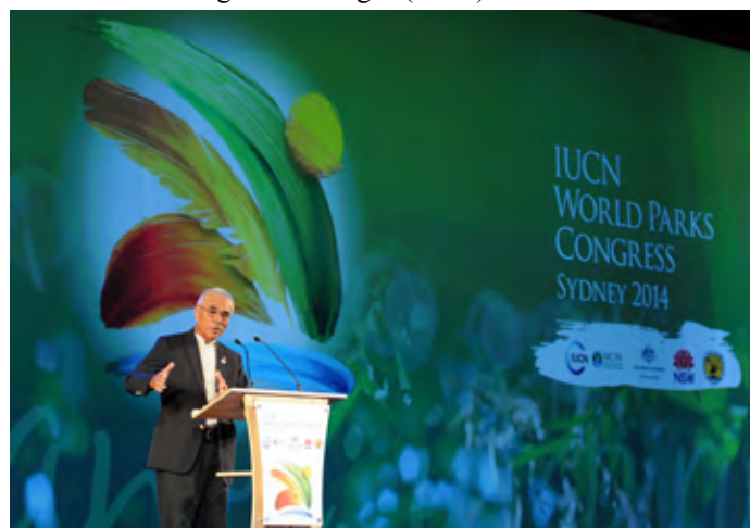
Anote Tong, President of Kiribati

Reminding participants that low-lying island states are at the frontline of climate change, Anote Tong, President of Kiribati, commended the announcement made the previous day by the US and China on greenhouse gas (GHG) emission reduction