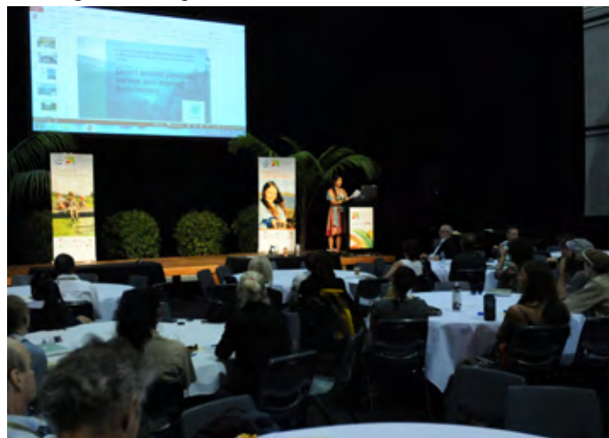
Stream 7: Respecting Indigenous and Traditional Knowledge and Culture

STREAM SEVEN: Respecting Indigenous and Traditional Knowledge and Culture: Panelists explored issues related to indigenous rights and traditional knowledge, and integrating these into long-term partnerships that underpin PA management and contribute to the achievement of conservation goals. They discussed issues of justice, including the continued need to address displacement of traditional peoples and criminalization of livelihood activities within PAs. On rights of indigenous peoples, panelists underscored access and benefit sharing, and free prior and informed consent. For the Promise of Sydney, panelists urged focusing on implementation. They stressed the role of indigenous people in the climate change and post-2015 development agendas, encouraging states to implement the 2014 World Conference on Indigenous Peoples Outcome Document.