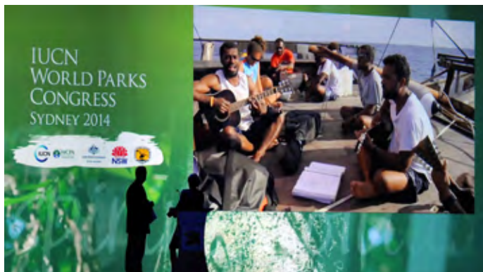
Video documentary of the "Mua" Voyage to WPC 2014

targets. He explained that Kiribati's Phoenix Islands Protected Area, comprising 11% of the country's EEZ, will enforce a commercial fishing ban beginning in January 2015.