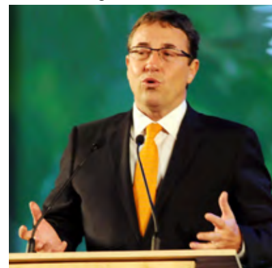
Achim Steiner, UN Under-Secretary-General and UNEP Executive Director

Achim Steiner, UN Under-Secretary-General and UNEP Executive Director, presented on developments since the previous WPC in Durban, saying the environment agenda has progressed from that of “being in the last line of defense, to being in the front line.” On the challenges of the decade, he highlighted the financial crisis that has sapped countries’ financial resources, and commended the African countries that have substantially increased their PA coverage in spite of being among some of the world’s poorest nations.