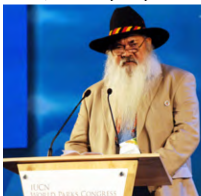
Patrick Dodson, Australian Aboriginal leader

Patrick Dodson, Australian Aboriginal leader, and former Chair of the Council for Aboriginal Reconciliation, emphasized the interconnectedness of humans with each other and nature. He observed that what we demand in “the quality of our livelihoods”