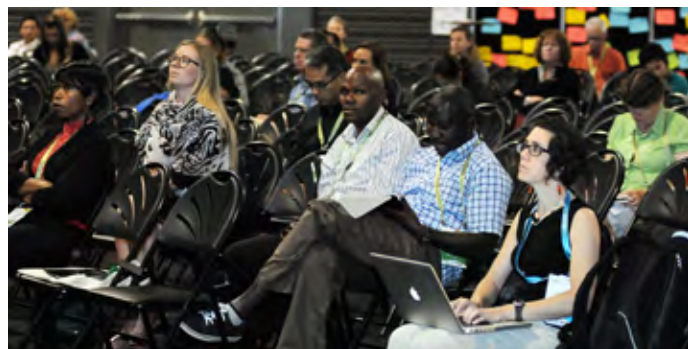
Participants during the session on "Restoring Natural Systems to Provide Resilience to Climate Change"