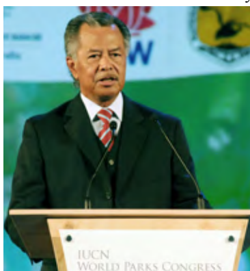
Henry Puna, Prime Minister of the Cook Islands

Henry Puna, Prime Minister of the Cook Islands, described conservation efforts in his country's EEZ, including: passing of