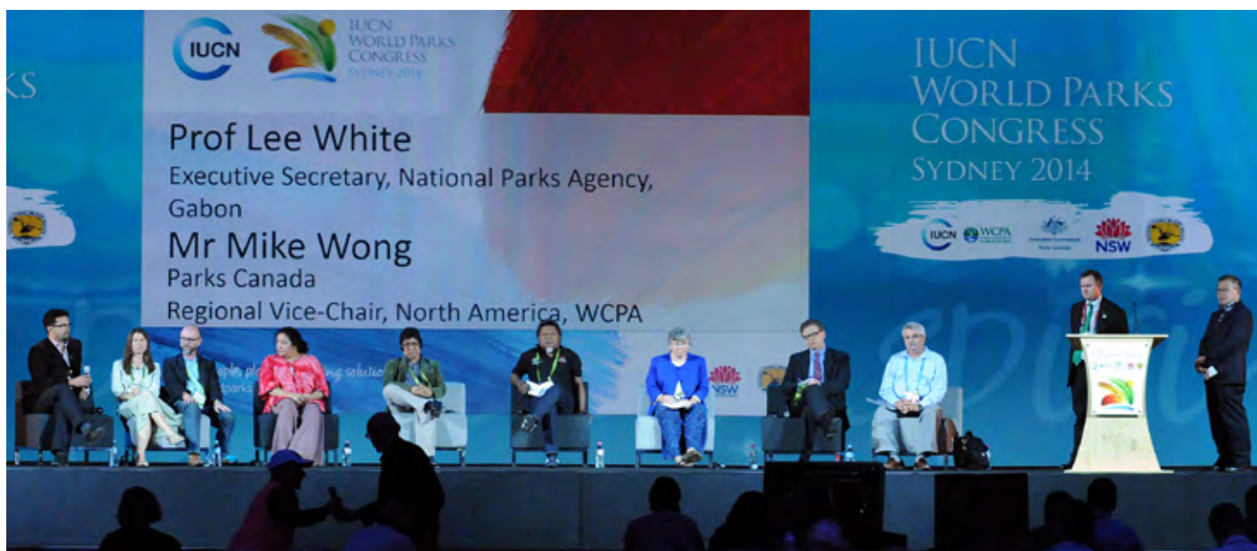
Parallel Plenary III stream leaders presented recommendations from Streams 5 & 7 and cross-cutting themes

The stream proposed a Capacity Development Road Map to provide directions for achieving the levels of capacity development required for effective management.