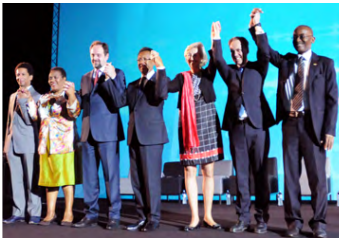
High-level representatives after making their countries' commitments to the Promise of Sydney