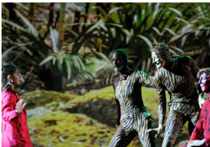
Performance on inspiring the youth to protect the environment