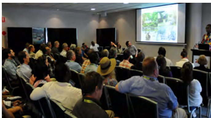
Stream Session 6: Governance, Sustainable Use of Wild Resources and Combating Wildlife Crime