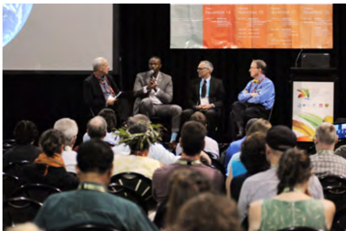
Stream 2: Responding to Climate Change

attracting funding for biodiversity conservation; and using parks for awareness-raising on the impacts of climate change. One speaker explained that ecosystem restoration globally could help avoid 0.5°C of warming, and others emphasized the importance of communicating on climate change and biodiversity success stories in language people can relate to.