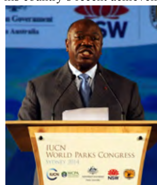
Ali Bongo Ondimba, President of Gabon, and Co-Patron of WPC 2014

PA network coverage to 21% of the national territory, and integrating biodiversity into national land-use planning and management of Gabon’s marine Exclusive Economic Zone (EEZ). President Ondimba announced Gabon’s decision to create a network of MPAs to cover 23% of its territorial waters. He urged participants to make a pledge in Sydney to take action on climate change, and support the men and