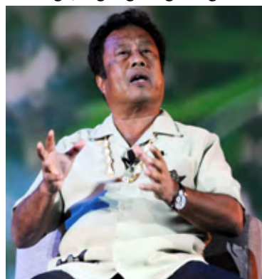
Tommy Remengesau Jr., President of Palau

Participants gave a standing ovation to the crews of four Pacific voyaging canoes who journeyed 6,000 nautical miles across the Pacific Ocean to attend WPC 2014. Through a traditional “haka” performed by the crew and a video documenting the voyage, the crew delivered the “Mua” Message, highlighting the global value and significance of