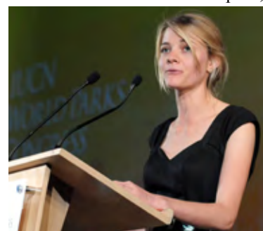
Jessica Watson, Australian sailor and WPC 2014 Champion