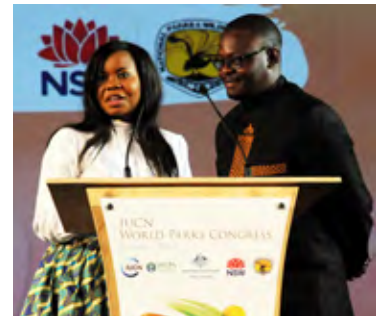
Young rangers from South Africa

Ali Bongo Ondimba, President of Gabon, and Co-Patron of WPC 2014, underscored the importance of implementing commitments made at the WPCs and under the Aichi Biodiversity Targets of the CBD. He provided examples from his country’s recent achievements in expanding its terrestrial