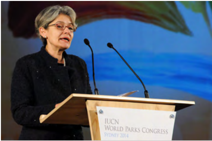
Irina Bokova, Director-General, UNESCO

of the greatest environmental threats, and noted that PAs: are effective tools for conserving species and natural habitats; store 15% of the global terrestrial carbon stock; and support the livelihoods of more than one billion people. She noted progress since the last WPC, including toward Aichi Biodiversity Target 11 (on expanding terrestrial and marine PAs) of the Convention on Biological Diversity (CBD). She described WPC 2014 as an opportunity to build on the achievements made over the last ten years and set the agenda for PAs for the next decade, while taking into account the role of PAs in mitigating the impacts of climate change and conserving biodiversity. She called upon the Congress to “work toward a global commitment to safeguard one of the planet’s most precious resources, protected areas.”