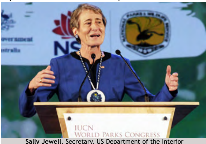
Sally Jewell, Secretary, US Department of the Interior

MORNING SESSION PART II: Irina Bokova, UNESCO Director-General, emphasized that PAs play an important role in strengthening the stability of communities, and contribute to peace and socio-economic development. She underscored