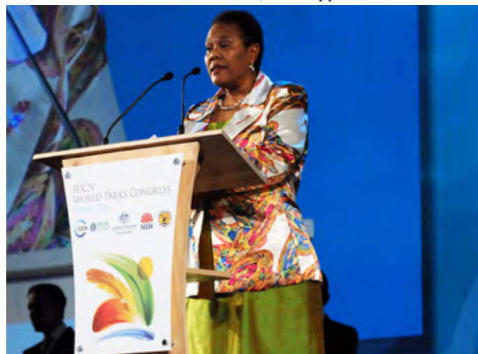
Barbara Thomson, Deputy Minister of Environmental Affairs, South Africa

Barbara Thomson, Deputy Minister of Environmental Affairs, South Africa, said that, by 2024, her country would create at least 60,000 new sustainable jobs and two million hectares of new conservation land, and support more than a