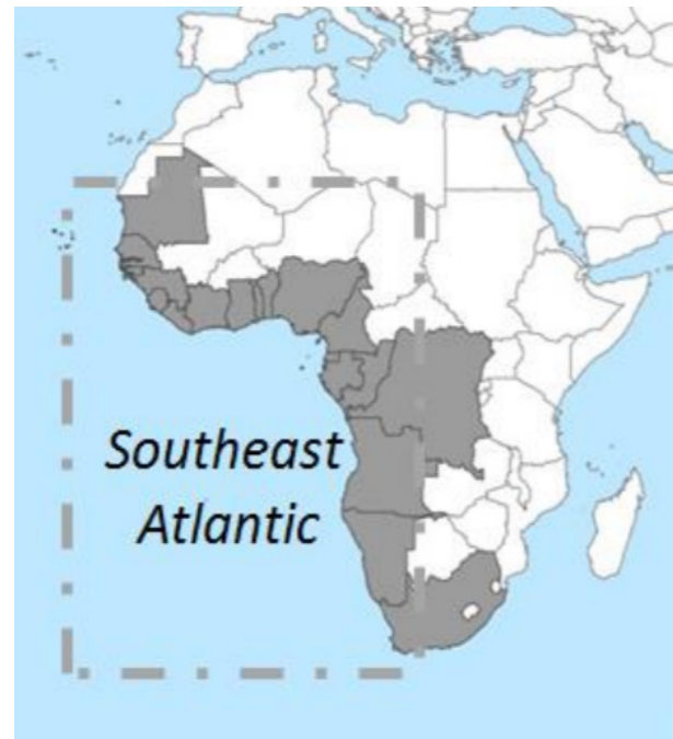
Figure 1. Focal region of the STRONG High Seas project in the Southeast Atlantic

temperatures and ocean acidification, which in return will affect livelihoods of local communities (Diop, et al. 2011).